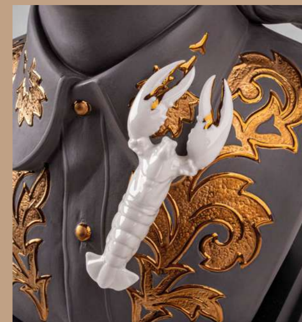
DALÍ & SURREALISM 01009812 42 x 29 x 23 cm 16 ½ x 11 ½ x 9" Limited Edition of 250 units

Dalí, one of the most singular and widely recognized artists of the 20th century, is portrayed in this creation that captures his unmistakable personality. A tribute to one of the most influential cultural figures of our time.