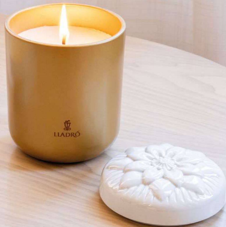
LOTUS FLOWER CANDLE - GARDENS OF VALENCIA 01040324 12 x 8 x 8 cm 4 3/4 x 3 1/4 x 3 1/4"

A creation designed to accompany moments of calm, reflection, and inner well-being.