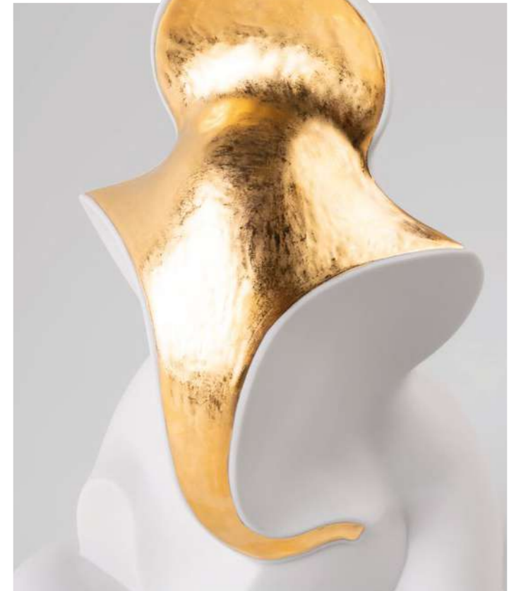
LORD GANESHA – ETERNAL LIGHT 01009804 26 x 18 x 14 cm 10 ¼ x 7 x 5 ½"

Lord Ganesha is one of the most revered deities in Hinduism. He symbolizes wisdom, intelligence and new beginnings. In this creation, we reinterpret his image through abstraction, applying a refined approach to both form and decoration. We establish a dialogue with tradition from a current perspective, connecting spirituality and design.