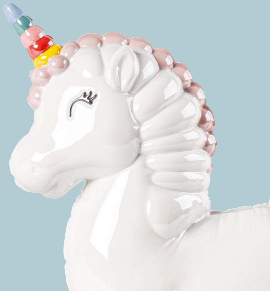
UNICORN 01009808 26 x 26 x 11 cm 10 1/4 x 10 1/4 x 4 1/4"

The piece is handcrafted from start to finish and shows how a childhood game can evolve into a contemporary object. It is a porcelain creation that speaks the design language of today.