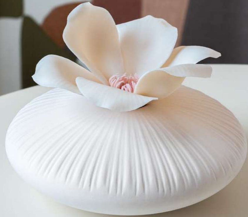
IKEBANA FLOWER 01040320 8 x 11 x 11 cm 3 1/4 x 4 1/4 x 4 1/4"

Inspired by the Japanese art of Ikebana, this porcelain creation reinterprets the delicacy and balance of nature. Each petal and pistil, handcrafted one by one with precision, shape a flower that reflects attention to detail and craftsmanship.