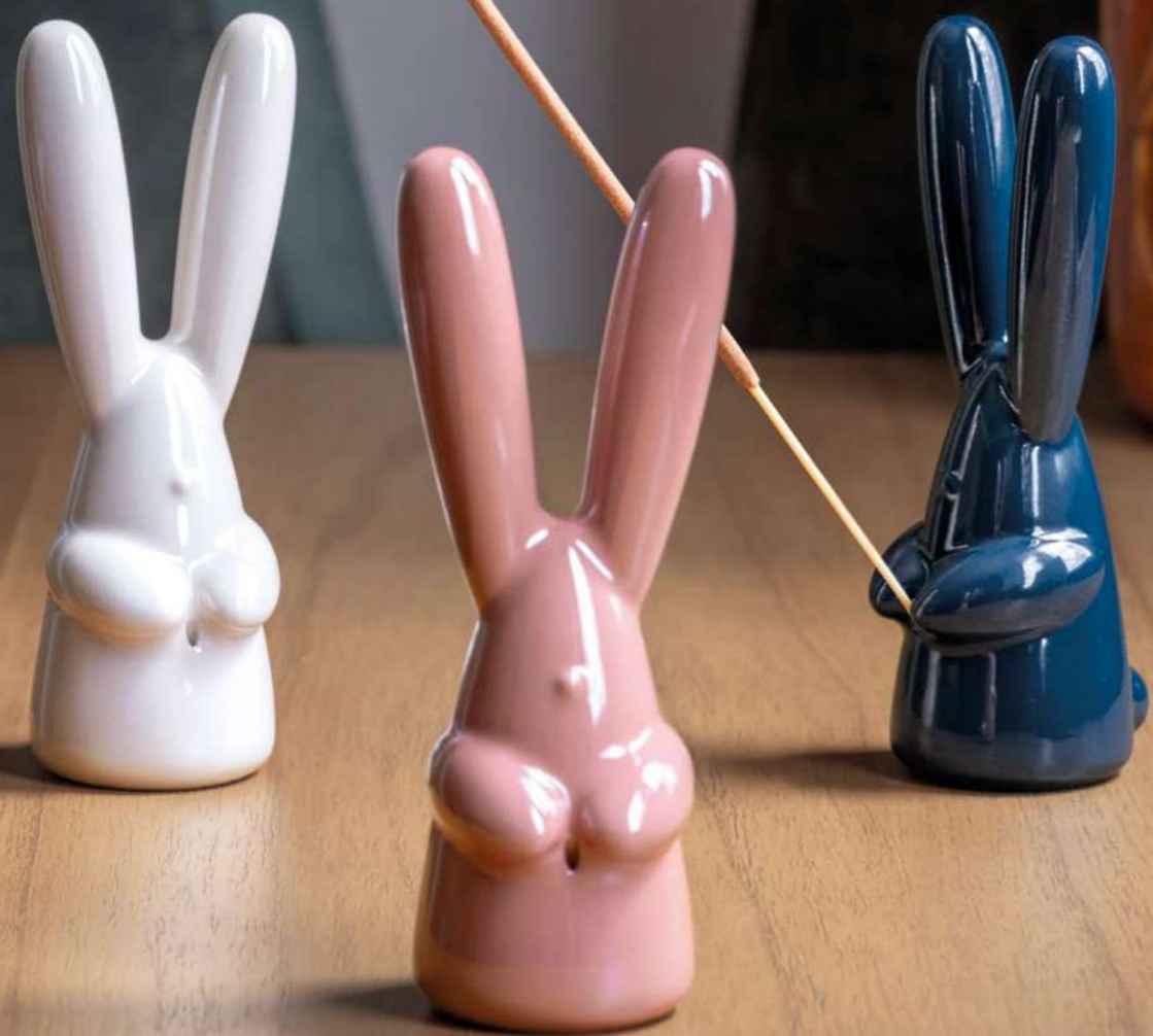
BUNNY (DARK BLUE) 01040318 12 x 5 x 5 cm 4 3/4 x 2 x 2"