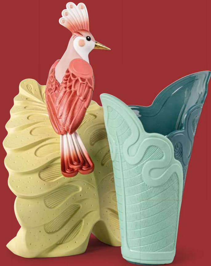
UTOPICAL VASE 01009813 44 x 32 x 34 cm 17 1/4 x 12 1/2 x 13 1/2"

This vase joins the Utopical universe, a place where imagination and design coexist naturally. Like the rest of the collection, it begins with the observation of nature and transforms it into a contemporary object designed to offer visual appeal without sacrificing function.