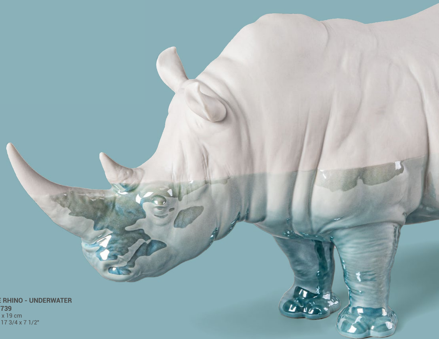
WHITE RHINO - UNDERWATER 01009739 22 x 45 x 19 cm 8 3/4 x 17 3/4 x 7 1/2"

The perfection of forms is combined with stunning decoration in degraded blue tones that achieve a quasi-real effect of immersion in water. The end result are contemporary creations not only with wonderful decorative potential but also capable of captivating us with their message and with their magnificent handcrafted elaboration in porcelain.