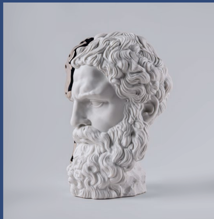
ETERNAL FLUIDITY - THINKER 01009732 31 x 20 x 22 cm 12 1/4 x 7 3/4 x 8 3/4"

Wise men of old told us that reality is both permanence and becoming. There are essential, immutable truths but there is also time which does not stop and to which we must adapt. The works in the Eternal Fluidity collection took their inspiration from this ancient wisdom to create an allegory of classicism that co-exists with innovation, of the primal that embraces the constant flow of change.