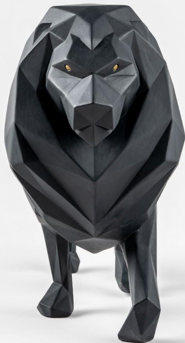
LION (MATTE BLACK) 01009746 25 x 48 x 14 cm 9 3/4 x 19 x 5 1/2"