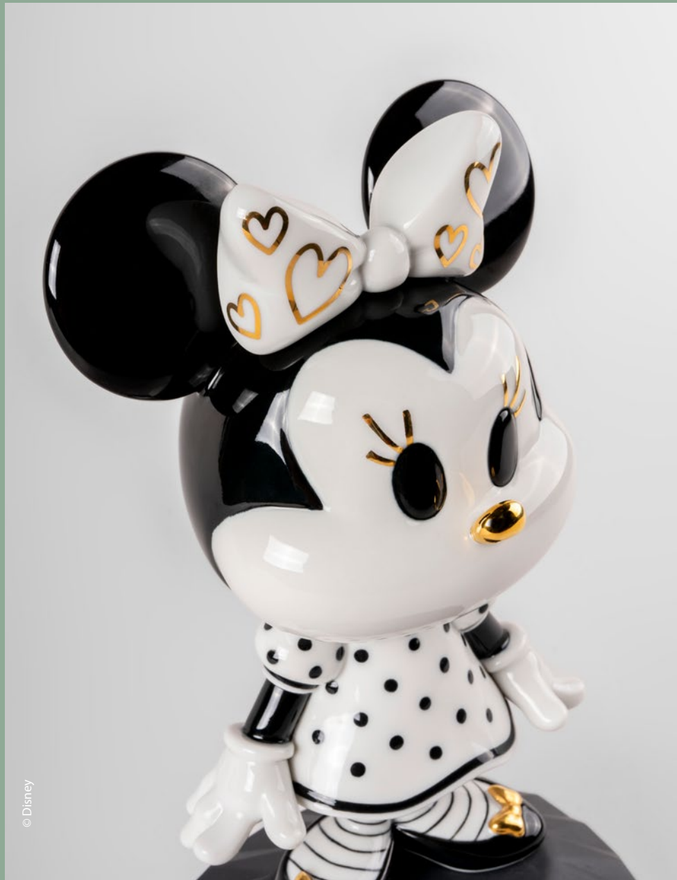
MINNIE IN BLACK AND WHITE 01009707 31 x 17 x 15 cm 12 1/4 x 6 3/4 x 6"