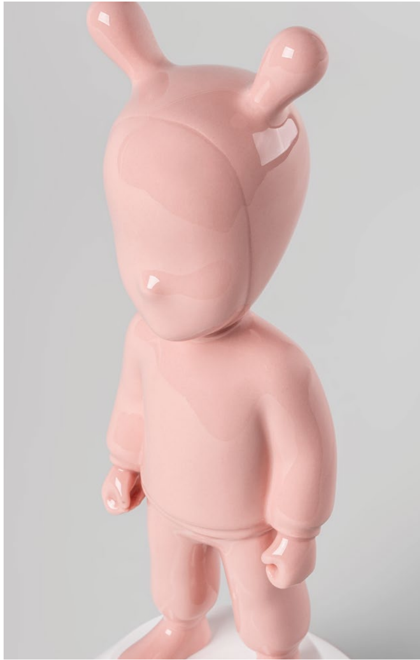
THE PINK GUEST-LITTLE 01007763 30 x 11 x 11 cm 11 3/4 x 4 1/4 x 4 1/4"