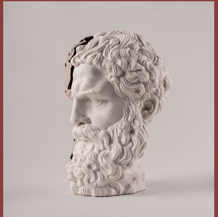
ETERNAL FLUIDITY - THINKER 01009732 31 x 20 x 22 cm 12 1/4 x 7 3/4 x 8 3/4"

Wise men of old told us that reality is both permanence and becoming. There are essential, immutable truths but there is also time which does not stop and to which we must adapt. The works in the Eternal Fluidity collection took their inspiration from this ancient wisdom to create an allegory of classicism that co-exists with innovation, of the primal that embraces the constant flow of change.