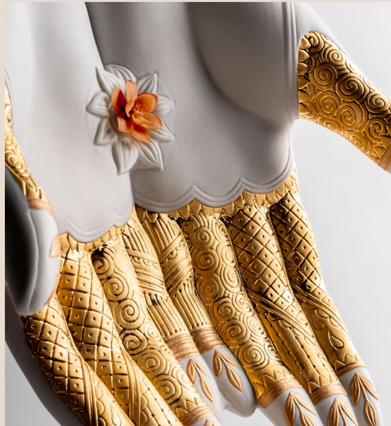
ABUNDANCE MUDRA 01009753 32 x 23 x 24 cm 12 1/2 x 9 x 9 1/2"

Abundance Mudra celebrates the wealth of life, the gifts it showers us with. And gratitude for all that life gives us.