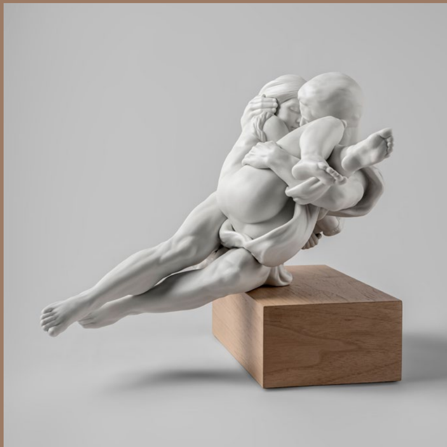
TOGETHER 01009751 31 x 32 x 36 cm 12 1/4 x 12 1/2 x 14 1/4"

White matte porcelain is the perfect medium to express warmth and to recreate with precision the details of the entwined bodies. Together is a work that manages to convey the connection and intimacy of two lovers, who seem to float in the air.