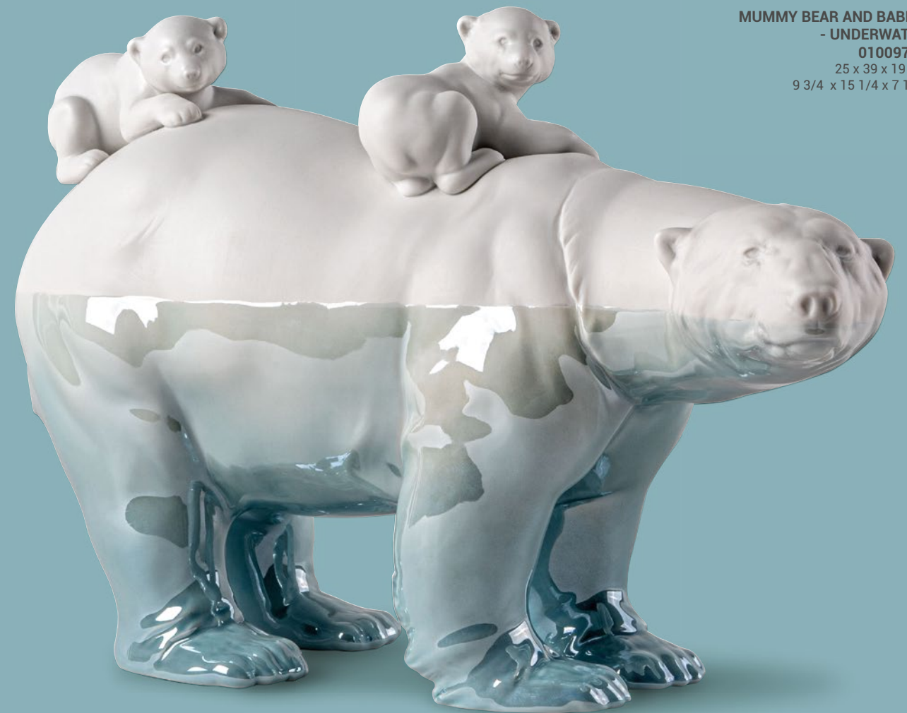
MUMMY BEAR AND BABIES - UNDERWATER 01009740 25 x 39 x 19 cm 9 3/4 x 15 1/4 x 7 1/2"

Thanks to our artists' consummate control of sculpture and decorative techniques developed specifically for these pieces, Underwater offers us an incomparable vision of the animal kingdom blended in with nature.