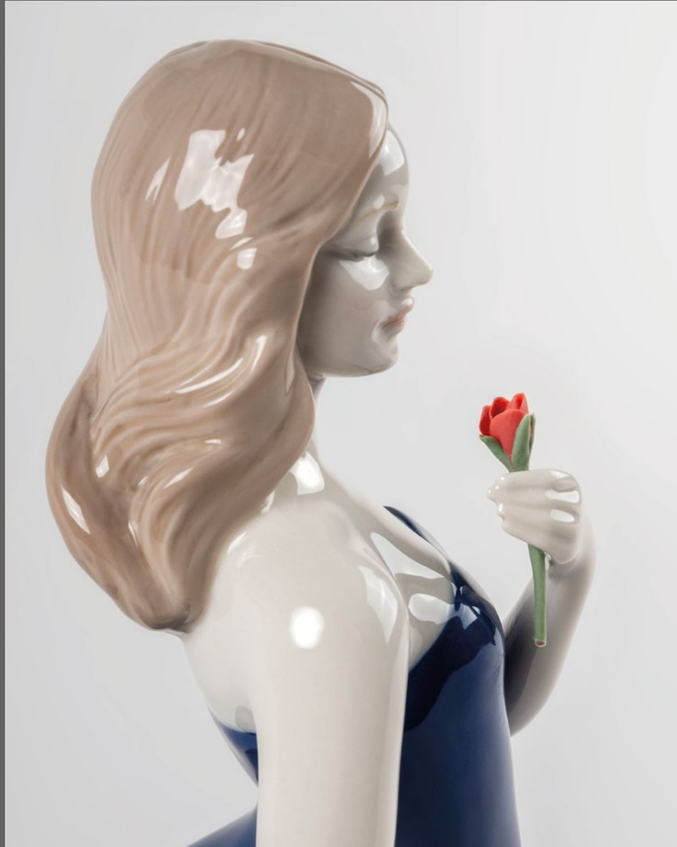
ANNUAL PIECE ROSE BALL 01009744 33 x 16 x 18 cm 13 x 6 1/4 x 7"