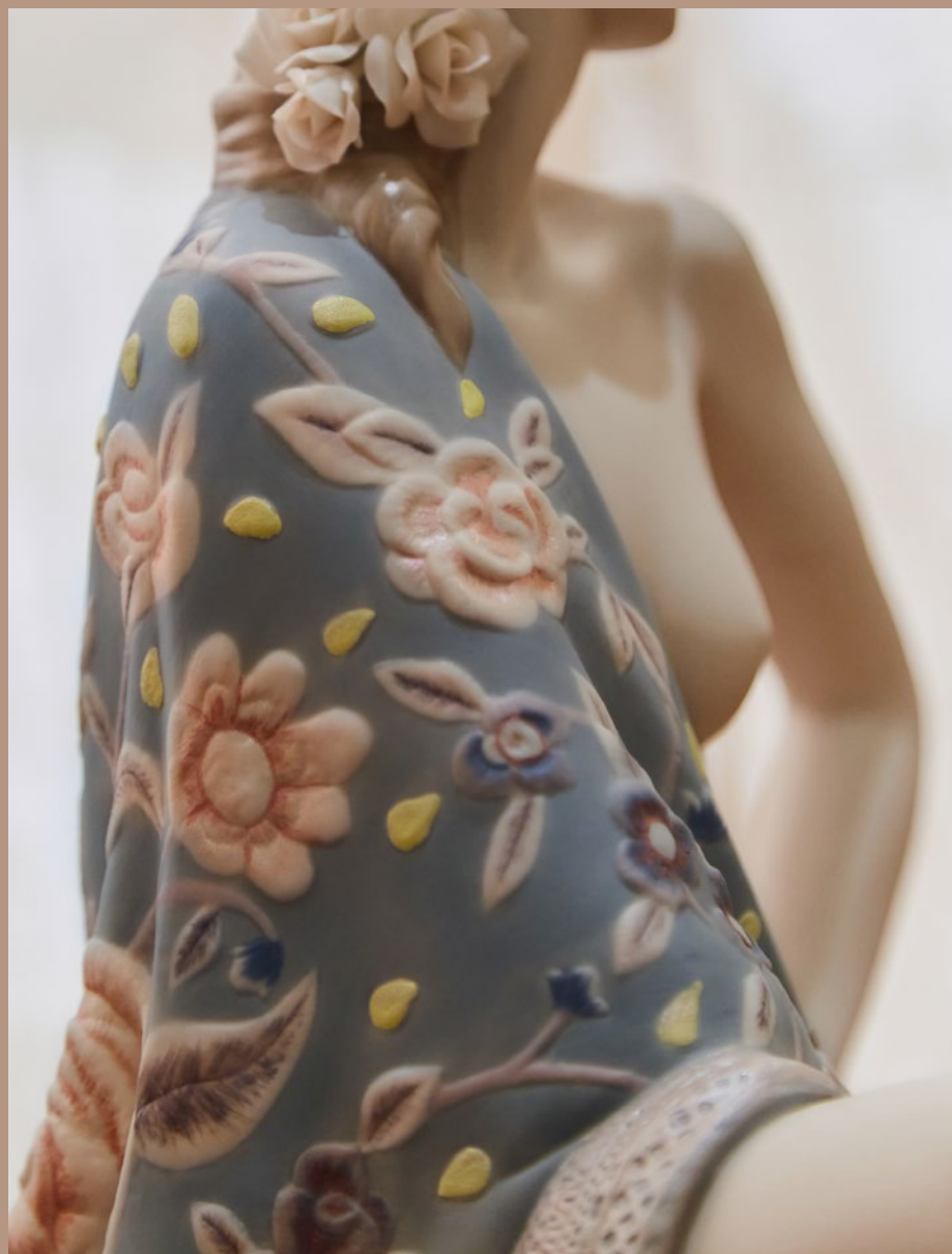
NUDE WITH SHAWL (METALLIC) 01009733 44 x 30 x 27 cm 17 1/4 x 11 3/4 x 10 3/4"