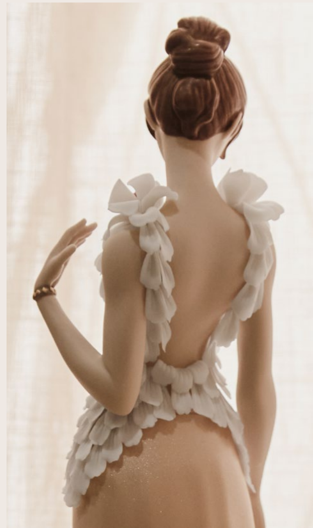
EXQUISITE EMBROIDERY 01009745 38 x 14 x 14 cm 15 x 5 1/2 x 5 1/2" Limited Edition of 300 units