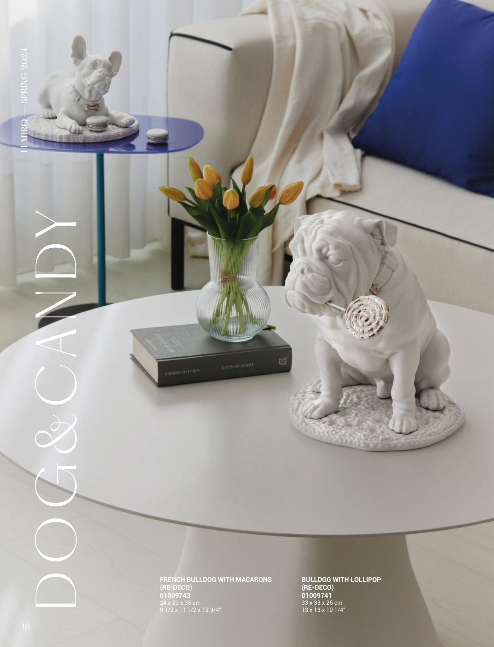
FRENCH BULLDOG WITH MACARONS (RE-DECO) 01009743 24 x 29 x 35 cm 9 1/2 x 11 1/2 x 13 3/4"